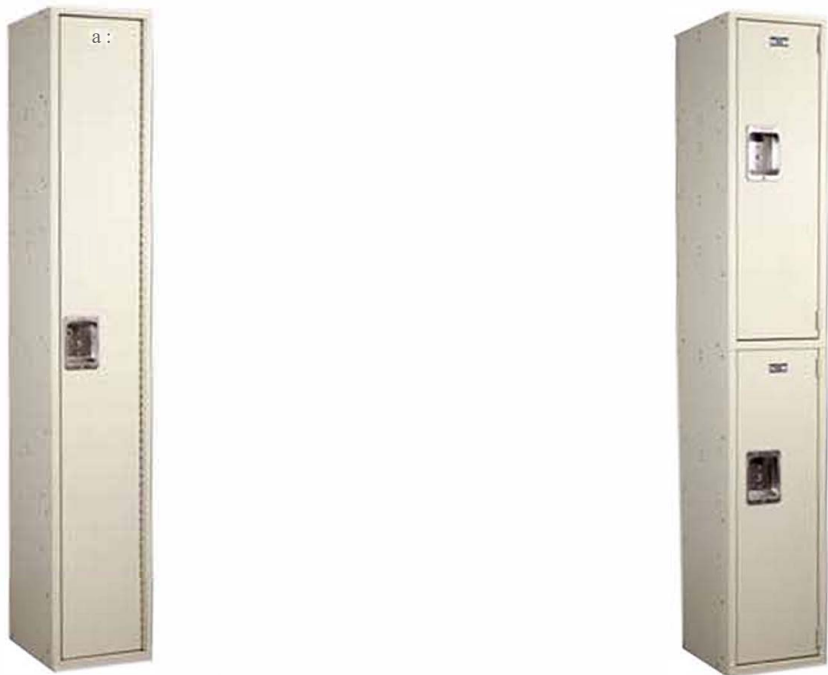
SINGLE TIER SIZES (per opening)

Keystone Quiet Corridor Lockers are manufactured with special attention to the requirements of the educational markets. Heavy duty 14 gauge doors with no louvers and quiet construction are standard with a variety of options to meet most specifications. They are available in all popular sizes and configurations.