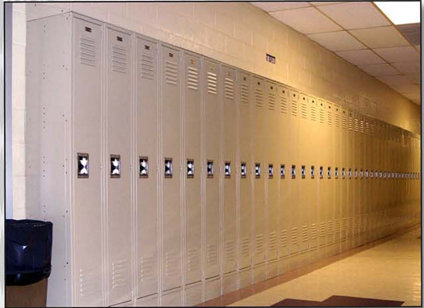
TYPICAL CORRIDOR LOCKER INSTALLATION WITH SLOPING HOOD